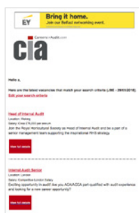
Job Alert example