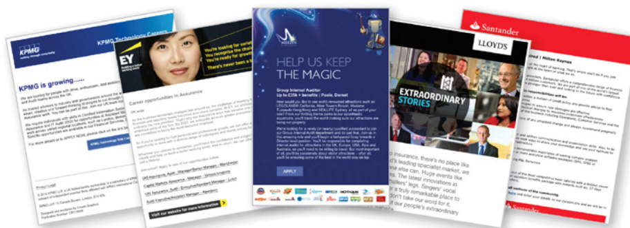
Direct Targeted Email examples

Choose your candidate distribution list from any criteria including job title, salary, location, sector, experience and skills, among many others. We currently have over 112,000 candidates who have subscribed to receive our Targeted Emails. Our response rates are impressive with typical click-through rates well above the industry average. All of these candidates are fully subscribed to hear about third party job offers. All Targeted Emails include proofs, list management, distribution and statistical reporting following each campaign. All emails are fully branded HTML and we can design them for you if required.