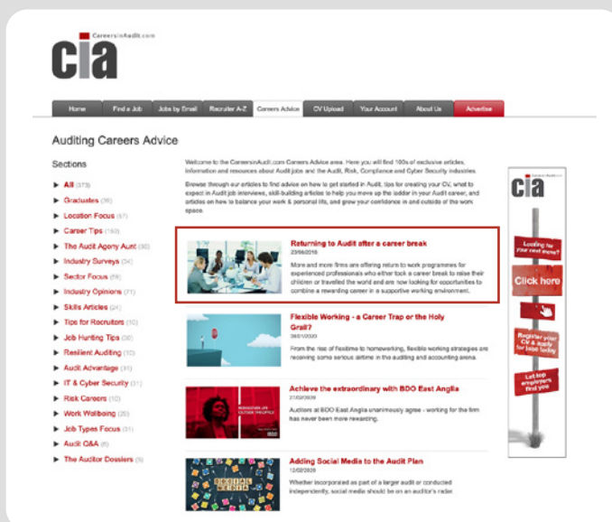
Pinned to the top of the Careers Advice Article homepage