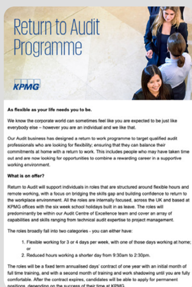
Supporting HTML Targeted Email