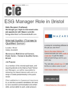
Job Targeted Email example