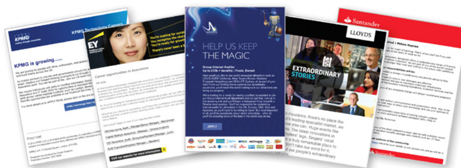
‘ESG Direct’ Targeted Email examples

Choose your candidate distribution list from any criteria including job title, salary, location, sector, experience and skills, among many others. We currently have over 112,000 candidates who have subscribed to receive our Targeted Emails. Our response rates are impressive with typical click-through rates well above the industry average. All of these candidates are fully subscribed to hear about third party job offers. All Targeted Emails include proofs, list management, distribution and statistical reporting following each campaign. All emails are fully branded HTML and we can design them for you if required.