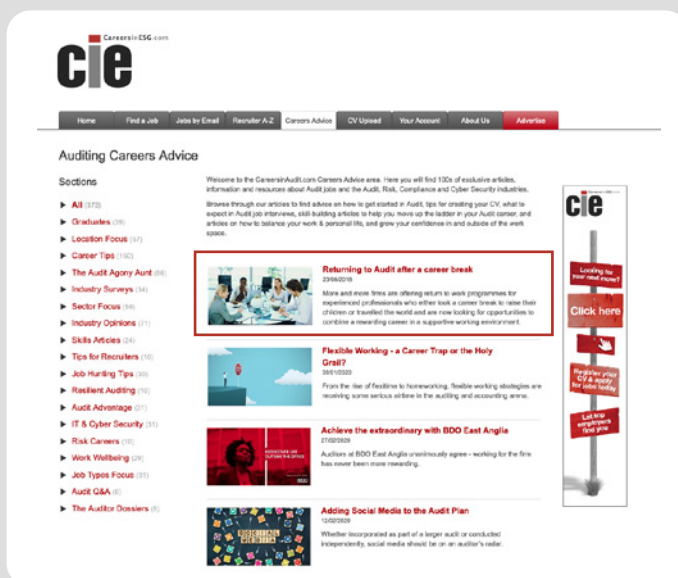
Pinned to the top of the Careers Advice Article homepage