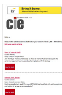
Job Alert example